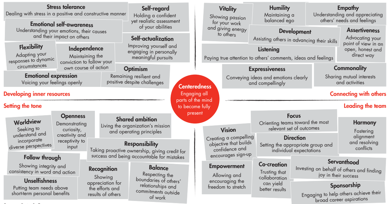
Figure 1: Bain Inspirational Leadership model